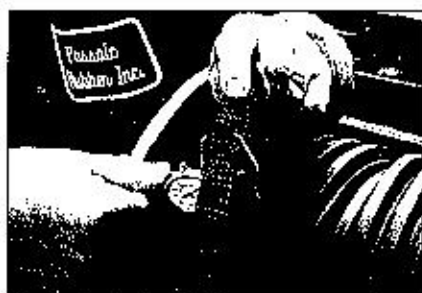
Passaic Rubber Co.'s newly purchased Roughtop V-belt line from Downers Grove, Ill.-based Flexible Steel Lacing Co. is used mostly for agricultural applications. It comes in a variety of sizes.